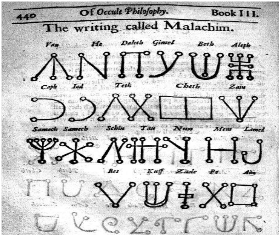
A Page from the Three Books of Occult Philosophy . Showing Angelic Symbols.