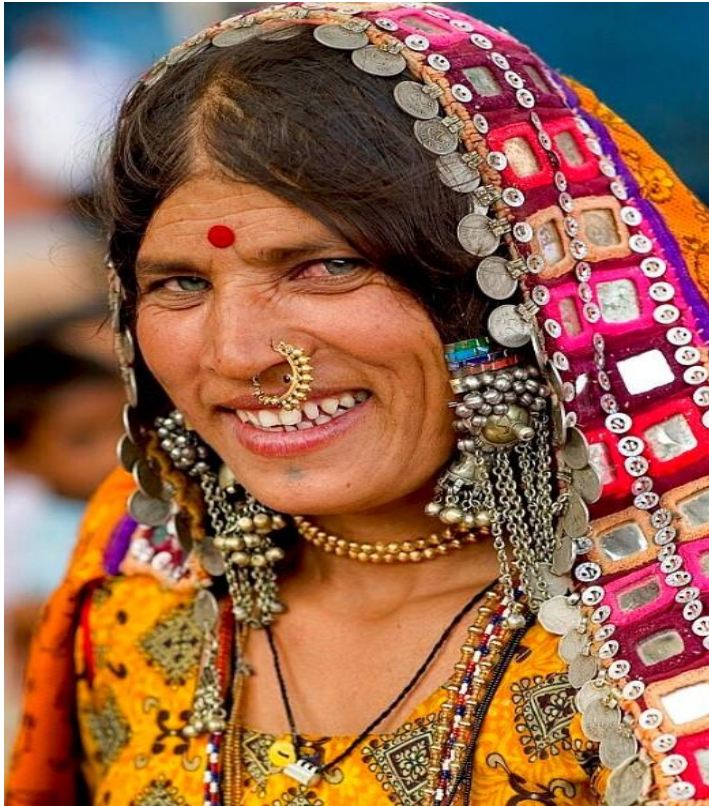
Romanian Gypsy Woman