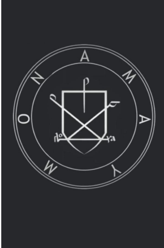
Seal of Amaymon: Demon King of the East